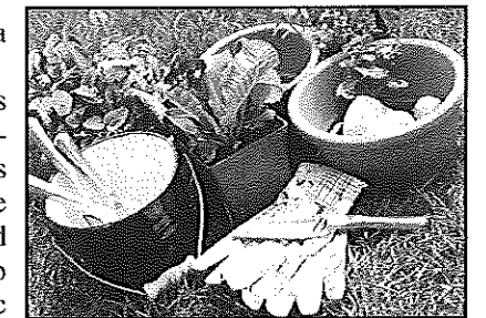
Show off your green thumb by volunteering to help Petrolia In Bloom make Petrolia a summer showplace.

Anyone who wants to find out more about the work of Petrolia In Bloom or who wishes to participate in this year's gardening efforts is invited to attend PIB meetings, which are held every second Wednesday of each month at the Oil Heritage District Community Centre. The next meeting is slated for Wednesday, March 10 at 7 p.m.